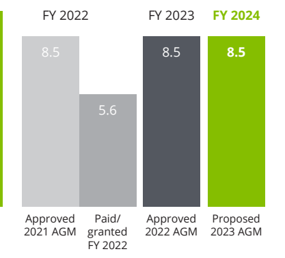
EXHIBIT 4: REMUNERATION APPROVED AND GRANTED FOR THE MEMBERS OF THE GROUP EXECUTIVE MANAGEMENT (IN MILLION CHF)

Long-Term Incentive Plan (LTIP) Three-year sharebased incentive plan fostering long-term value creation